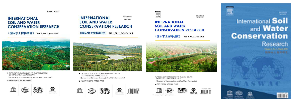
The covers for the first issues in volume 1, 2, 3 and 4

The ISWCR - the official journal of WASWAC, has published its second issue on line. This is also the second issue for ISWCR since its cover change. The covers for Volume 1 to 3, including the years of 2013, 2014 and 2015, were various for different issues. Starting from this year, the cover for our journal will be fixed, and it is not necessary anymore for cover's replacement while new issue is coming. The new cover was designed by the editors of this journal, and has received great evaluation since it appeared in the late March of 2016. We hope that our members will enjoy it, too. We also believe that our journal will be better and better under all member's full support.